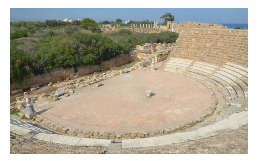
Fig. 3.6 Salamis-Constantia (the northern part of the city with the third century Bath-Gymnasium seen from the Theater)

Salamis-Constantia (see Fig. 3.6), located on the eastern coast of the island, did not simply shrink in size during the passage from Late Antiquity to the early Middle Ages. The construction of a new, well-built fortified enclosure, presumably in the second half of the seventh century, which deliberately cut the aqueduct as well as one of the main axes of urban circulation - the Cardo Maximus, reflects planning and the availability of resources. Excavations have revealed that a monumental gate was constructed at the former intersection of the Cardo and Decumanus, suggesting that the new fortifications were carefully planned to retain part of the ancient street grid. Beyond fortifications, evidence of a late seventh/early eighth-century workshop phase of occupation of the so-called 'Huilerie' complex, a former Roman urban villa located not far away from Salamis-Constantia's harbor, provides evidence of economic activity and continuity (Zavagno 2014, 125-9). A comparison can be made not only with similar structures excavated in Gortyn (so-called Byzantine Houses complex) and in many urban sites of Syria and Palestine but also with other Cypriot sites (Avni 2011). Specifically, excavations at Polis-Arsinoe have shed light on an area of the city composed of workshops, roads, and